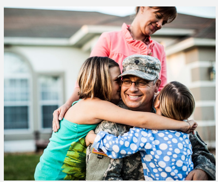
USDA is an equal opportunity provider, employer, and lender.

Visit the USAJobs Help Center to learn more: here.